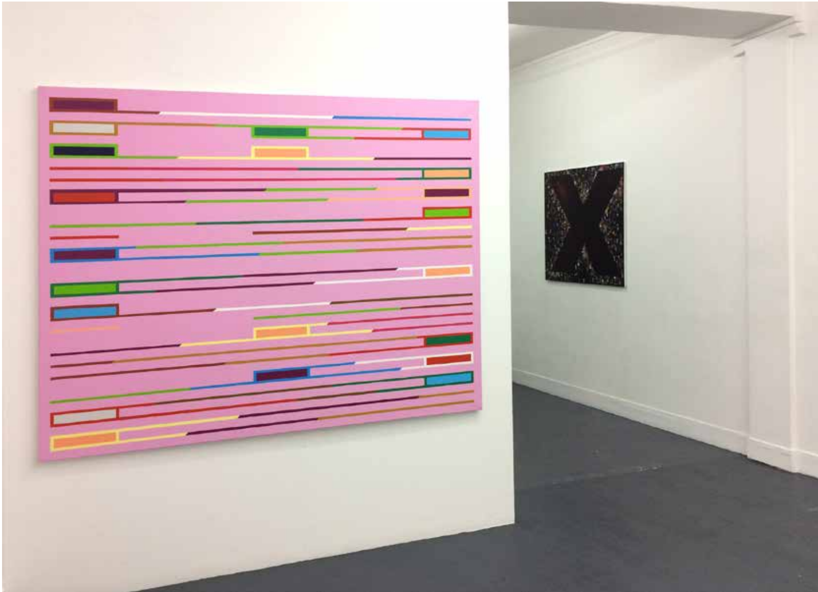
Exhibition view of «Jamais seules ...» Ivan FAYARD Galerie Houg - Paris 2017