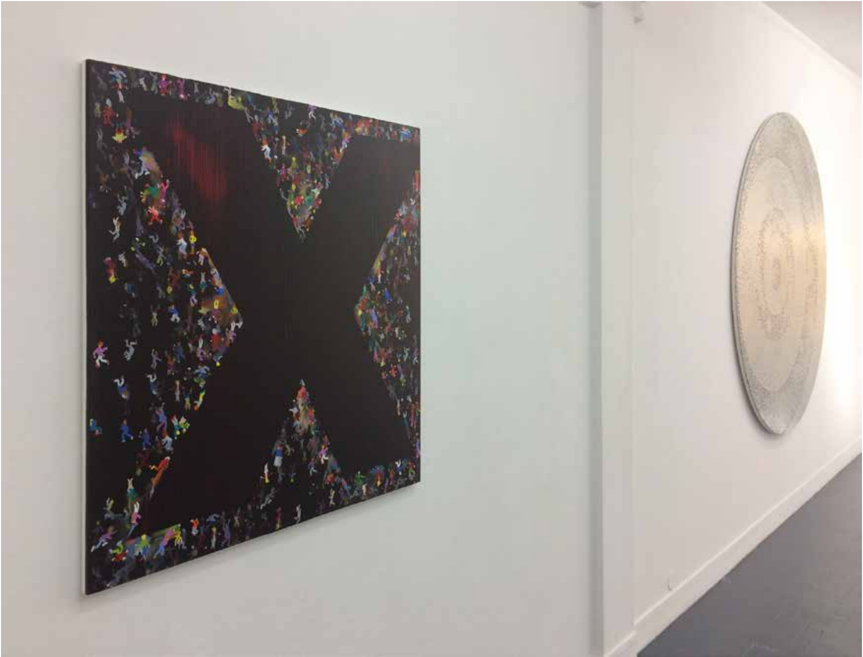
Exhibition view of «Jamais seules ...» Ivan FAYARD Galerie Houg - Paris 2017