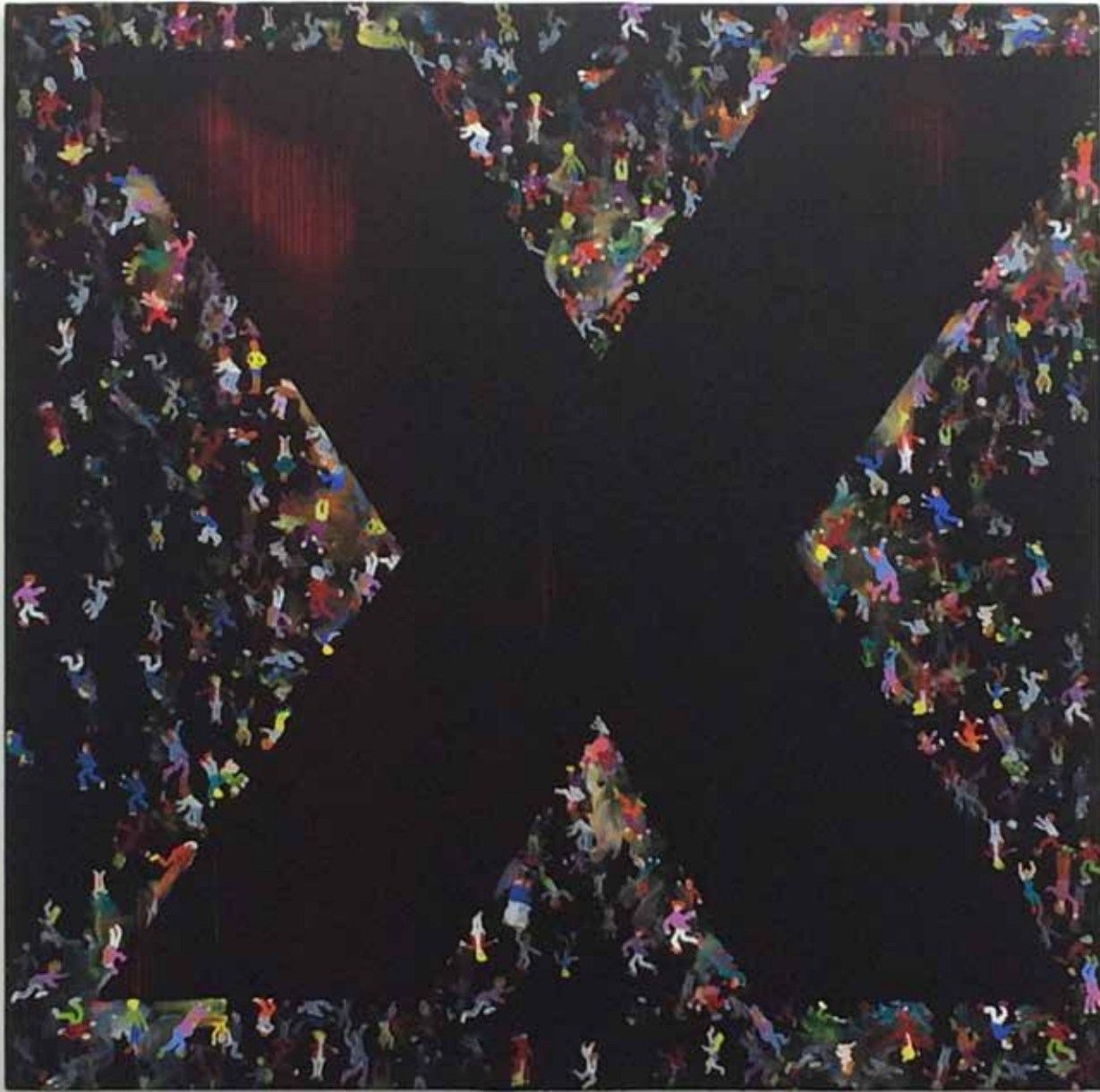
Ivan FAYARD X - 2017