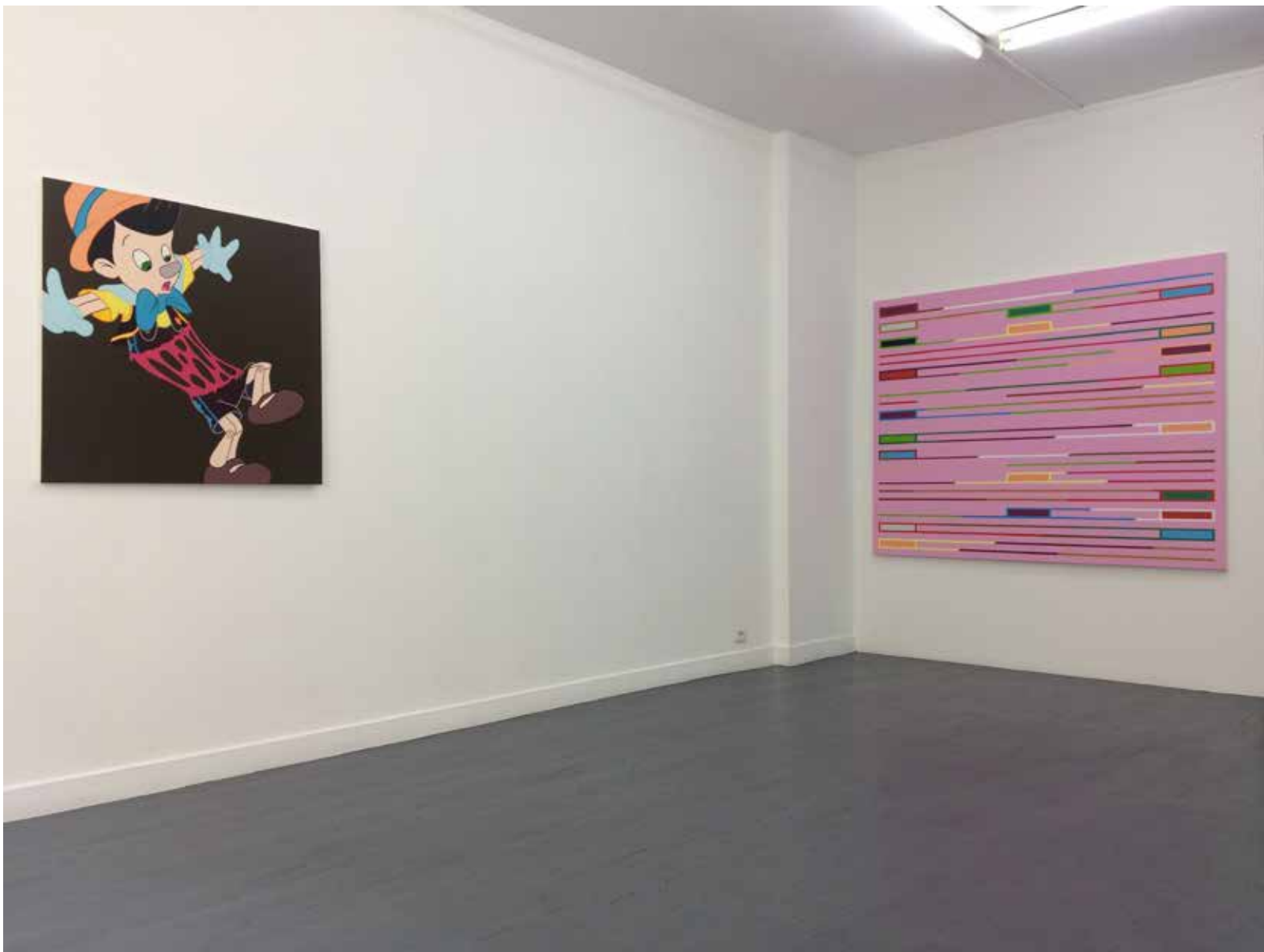
Exhibition view of «Jamais seules ...» Ivan FAYARD Galerie Houg - Paris 2017