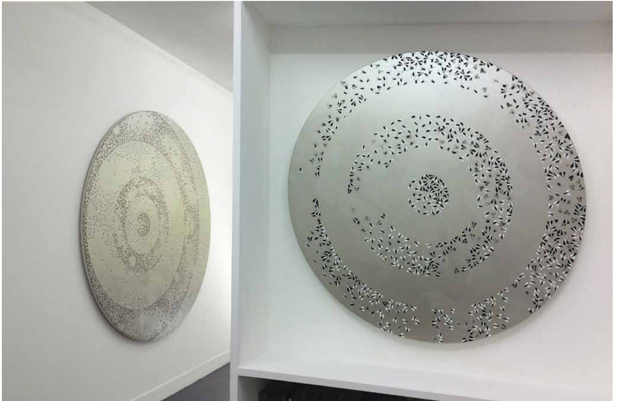
Exhibition view of «Jamais seules ...» Ivan FAYARD Galerie Houg - Paris 2017